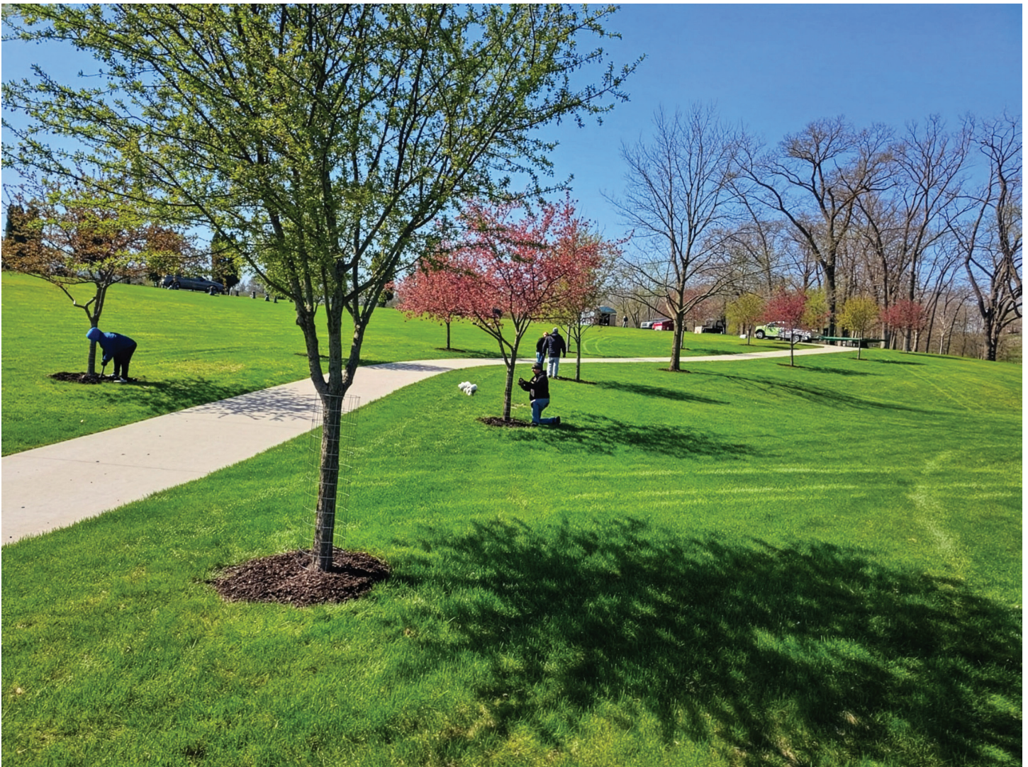
Volunteers fenced the Crabapple trees to protect them from deer and mulched the trees.

O n Sunday, May 17th the Annual Celebration/Reunion and Potluck will begin at 11:00 am in the church sanctuary. A keynote speaker and special music in the historic Red Oak Grove Church offers a unique religious opportunity to all. The delicious potluck and social gathering following the service is a custom not to be missed! You'll immediately notice beautiful new carpet in the church sanctuary and tile in the entryway (see next page)! Yes, it is a rich, bright red and the vivid color choice was proposed by one of the male Red Oak Grove Board Members! On April 18th, volunteers cleaned like crazy indoors and outdoors prior to the Annual Celebration. A heartfelt thank you goes out to all of them.