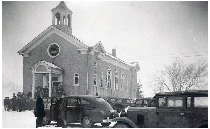
Red Oak Church 1941