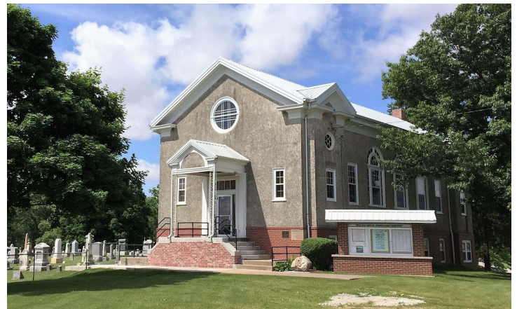
100 Years: 1920-2020

After about eight and a half months, the new church was ready for dedication March 13, 1921, however Iowa’s unpredictable weather postponed the event to April 17. But the weather then was even worse — “Middle West Swept by Terrific Storm” was one headline.