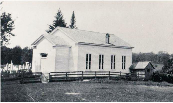
Old Church replaced 1920